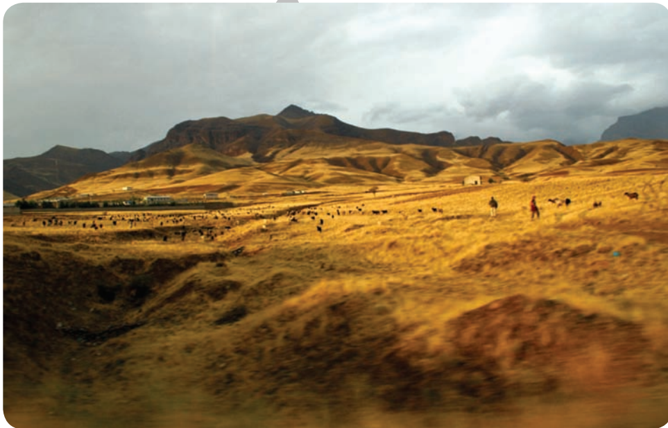
Alamut, around 100 km from present-day Tehran - Qazvin Province -Iran