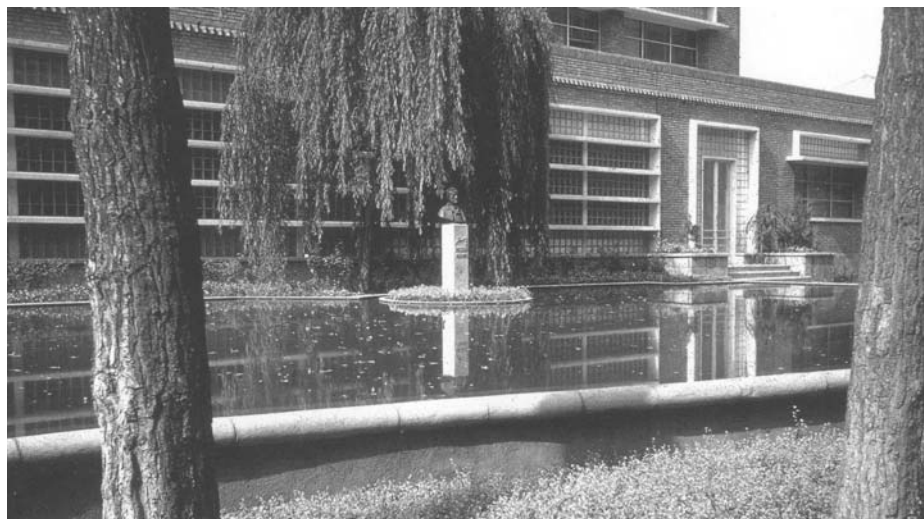
Figure 1. A view of Pasteur Institute of Iran. In the middle part, the statuette of Louis Pasteur (1822 – 1895), the founder and first director of the Pasteur Institute of Paris is seen.