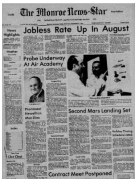
Figure 7. Repercussion of Dr. Bahmanyar's Activities in the American Newspaper "The Monroe News-Star" in 1975. 25

In 1956, Dr. Bahmanyar became the head of the