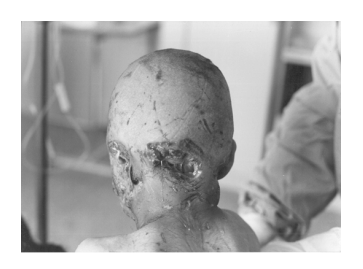
Figure 6 . A 6-Year-Old Child Attacked by a Rabid Wolf. In the site of bite, the brain and the spine were illustrated and under the guidance of Dr. Fayaz and following the treatment with anti-serum and rabies vaccine, he was rescued from rabies (after 2 years in 1984), Tehran.